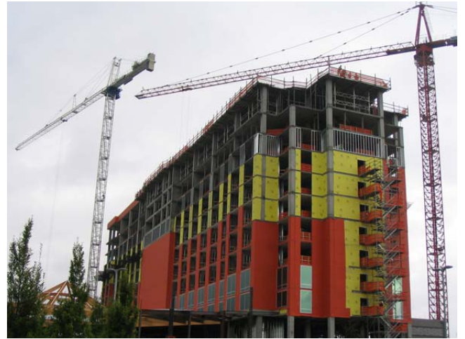
Over 90,000 sq. ft. WrapShield was used on the Tulalip hotel.

VaproShield offers specific installation fastener spacings for WrapShield for buildings between 70 to 625 feet in height, differentiated by exposure, building category, fixing types and wind speeds.